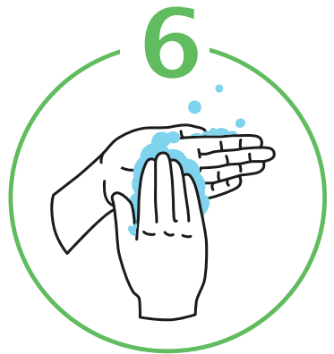
The tips of the fingers

Use a tissue to turn off the tap. Dry hands thoroughly.