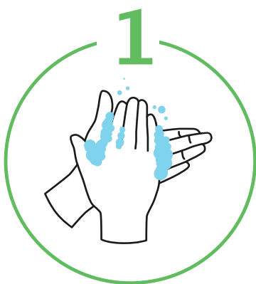
Palm to palm

Wash your hands with soap and water more often for 20 seconds