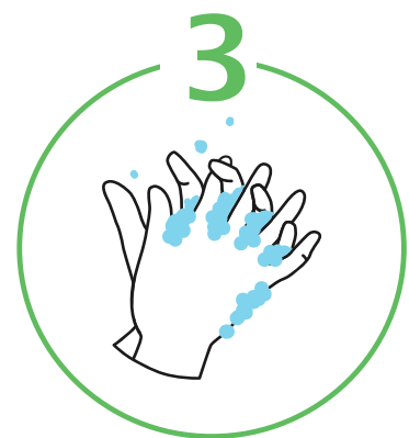
In between the fingers