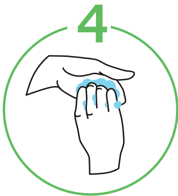
The back of the fingers