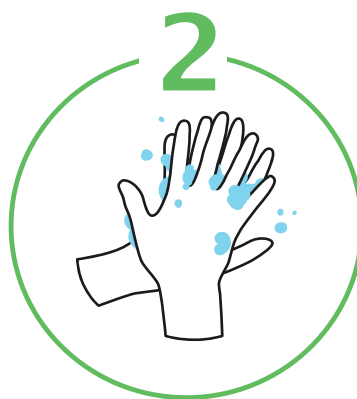
The backs of hands