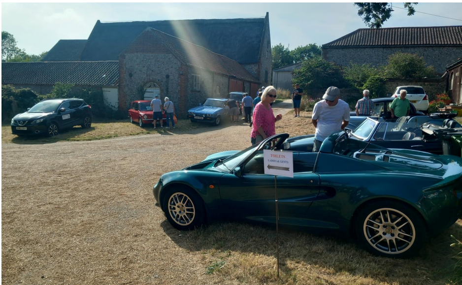
Historic Car Display

A busy afternoon with everyone enjoying the games.