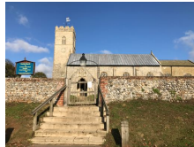
CHURCH WARDEN'S WHISPERS