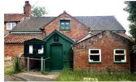
WHAT'S ON IN Knapton