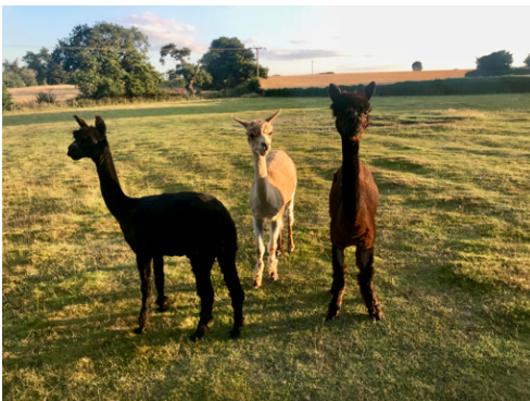
Calypso, Petali and Juno

They are quite easy to keep apparently living off grass and haylage with favourite treats being carrots and apples. They require shearing once a year, but sadly their wool, being English alpacas isn't quite good enough quality to make a fine wool coat for their owners!